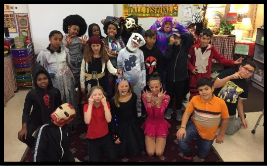
Our Fall Festival was a blast!